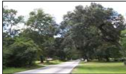
WAIBC is located on Scenic Hwy—61

The Bible portrays the church as the body of Jesus Christ and teaches that Jesus Christ is the Head over all (Eph. 1.22-23). Since Jesus Christ is our Head, our intention is that every aspect of our ministry might be an extension of His will and contribute to focusing our attention on Him.